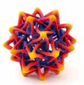
VisiJet PXL + Wax infiltrant for fast, affordable, beautiful color models